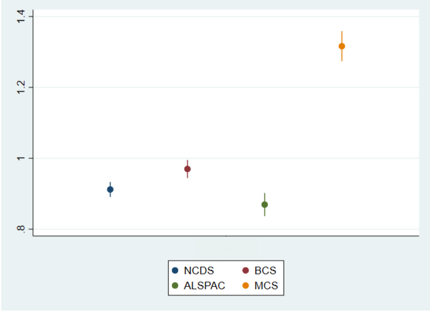
Fig.1 Means and 95% confidence intervals of harmonised emotional/internalizing items across cohorts at age 15