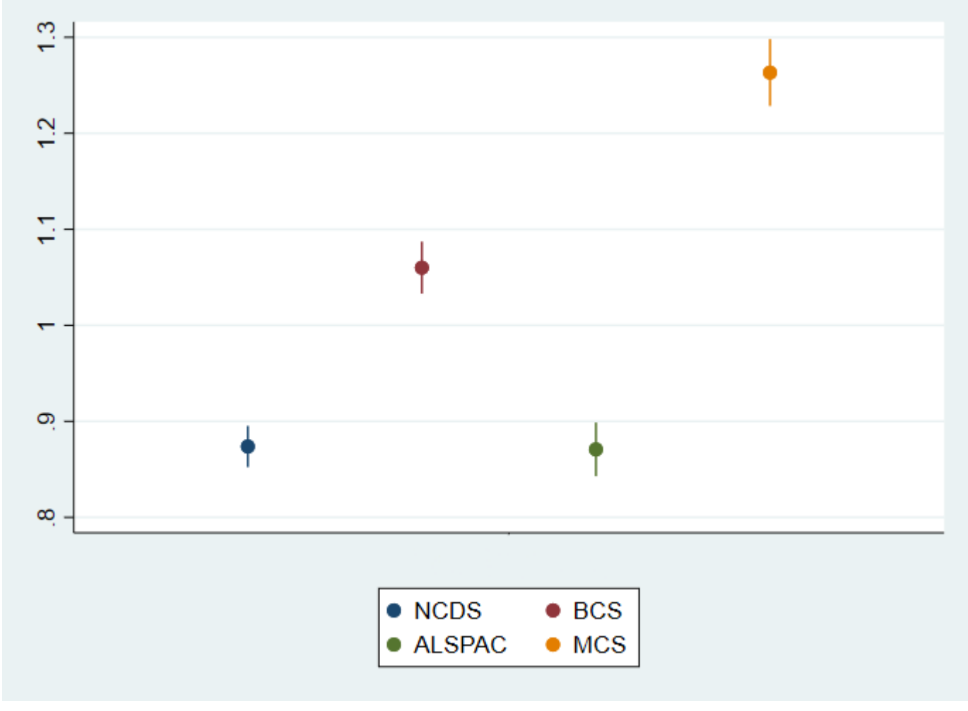
Fig.2 Means and 95% confidence intervals of harmonised behavioural/externalizing items across cohorts at age 15